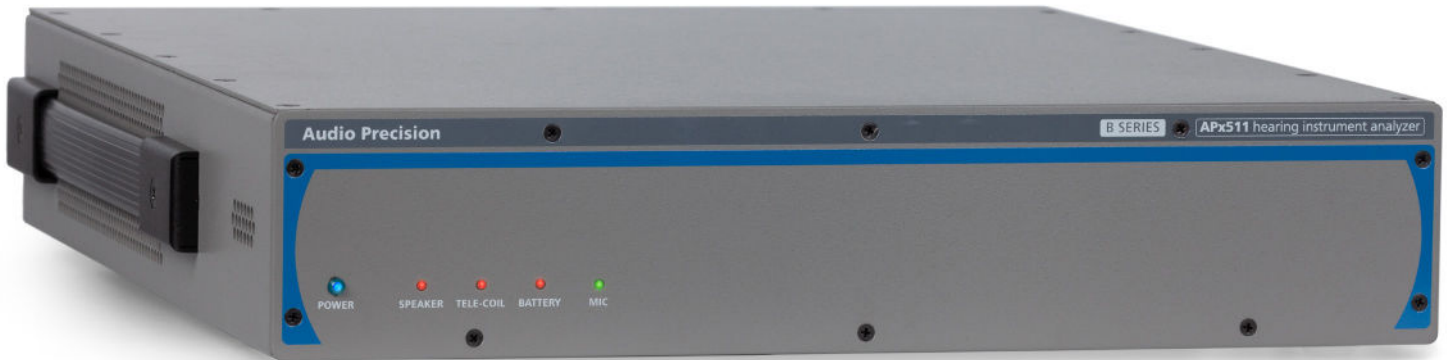
APx511 audio analyzer for hearing instrument production test

AP performance for hearing instrument production test