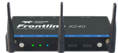
The conformanceHarmony LE Tester includes the powerful Frontline X240 Wireless Wideband Analyzer

Knowing that your IUT failed a test is important for conformance, but the conformanceHarmony LE Tester provides more than just a pass, fail or inconclusive result for conformance certification - it is a sophisticated protocol analysis and tester platform, providing test case logging and debugging. The conformanceHarmony LE Tester summarizes and helps to pinpoint the cause of a fail or inconclusive verdict with detailed information to help understand and debug each failure.