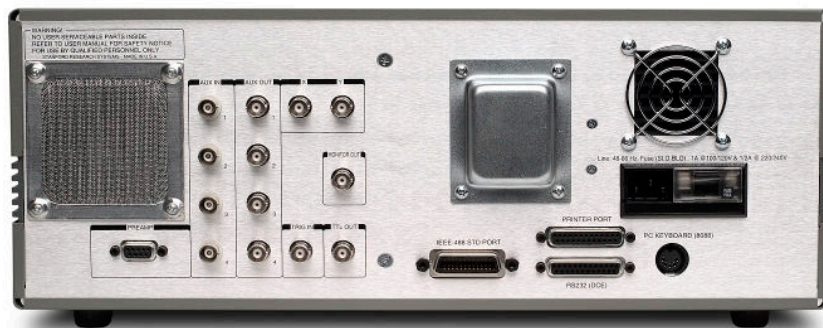
SR850 rear panel