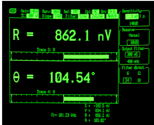
Large numeric readout with bar graph

to 512 Hz, you are able to see exactly how your data changes in time—not just what the current output value is. After the data has been acquired, the SR850 offers a variety of data reduction options, such as Savitsky-Golay smoothing, curve-fitting and statistical analysis. A built-in 3.5” disk drive, along with standard RS-232 and GPIB interfaces, makes it easy to transfer data to your computer.