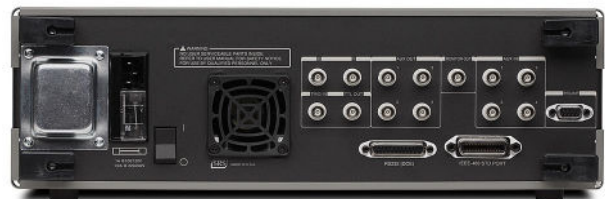
SR810/830 rear panel