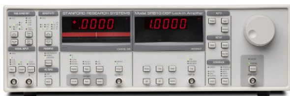
SR810 DSP Single Phase Lock-In Amplifier