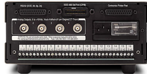
SR630 rear panel