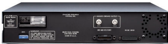
SR640 rear panel