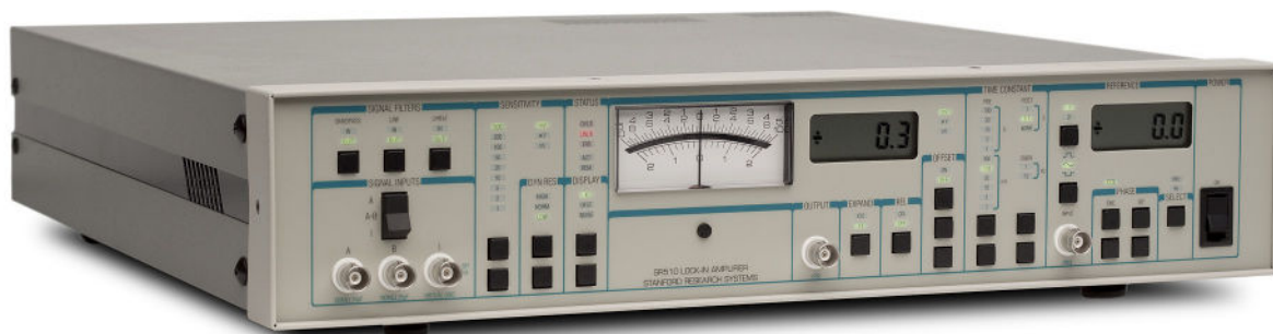
SR510 Lock-In Amplifier

An optional internal voltage-controlled oscillator provides both an adjustable-amplitude sine wave output and a synchronous, fixed-amplitude reference output. The sine wave amplitude can be set to 0.01, 0.1 or 1 V rms , and can drive up to 20 mA. The oscillator frequency is controlled by a rear-panel voltage input and can be adjusted between 1 Hz and 100 kHz. Typically, the sine wave output is used to excite some aspect of an experiment, while the reference output provides a frequency reference to the lock-in.