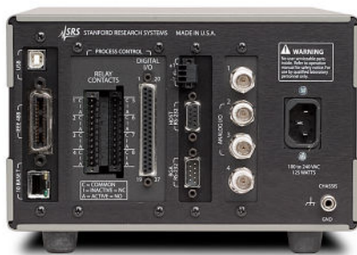
PPM100 rear panel

An embedded web server connects the PPM100 to the world wide web (password protected). The EWS can deliver measurement data to any standard internet browser. Use the EWS to monitor and control your vacuum system or to get automatic email notification of potential or real system problems.