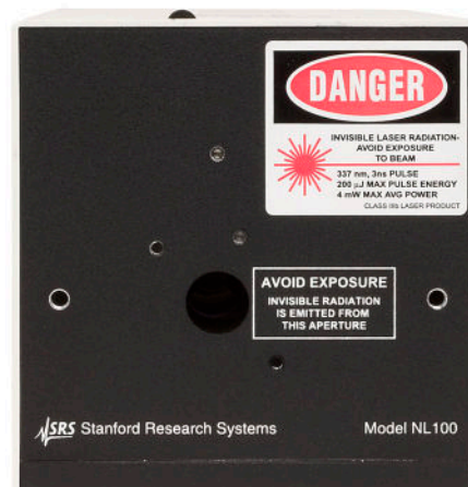
NL100 front panel