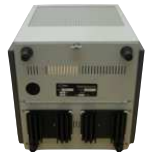
AP-3 Rear Panel Shown Above