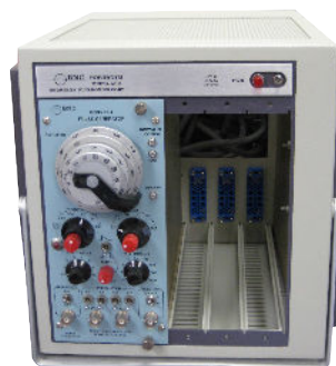
AP-3 with DB-4 NIM Pulse Generator shown above

BNC-blue painted blank panels are available to cover unused module cavities. The part numbers are: Single-width P/N 6823; Double-width P/N 6824; Triple-width P/N 6826. Empty modules in various sizes are available for OEMs or others who wish to design plug-in instruments for Portanims. Contact BNC for source information on modules in bulk or kit form.